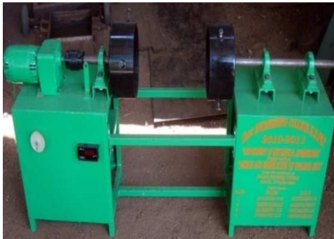
Fig. 3 Welding spinner to welded pipe in 5G position