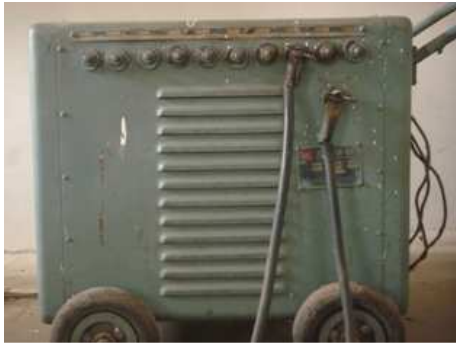
Fig.1 Johnson arc welding transformer

Welding operation is conducted on Apollo steel tube of diameter 48 mm with 3mm wall thickness by using a 3 phase (Johnson arc welding transformer) welding machine as shown in figure 1. The electrodes used for the process is Sun arc make (AWS Code E6013) of diameter 3mm to weld 3mm wall thickness pipes. The welding joints are tested for leak testing by using hydraulic hand pump of capacity 400 bars, at 30 bars and the leak testing setup is shown in figure 2. During welding tube is fixed in welding spinner and welded in 5G position as shown in figure 3 and in figure 4 shows welded tubes.