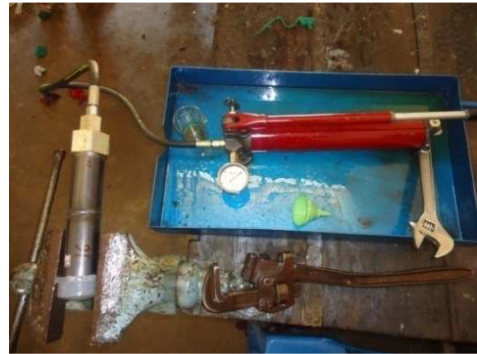
Fig.2 Leak testing setup