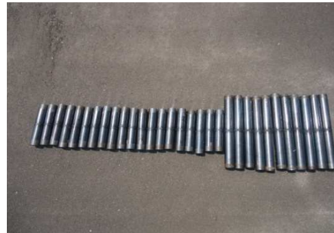
Fig. 4 Welded tubes