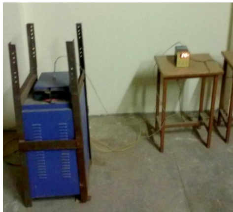
Fig. 1 a. Muffle furnace