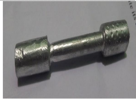
Fig. 6 MMC sample for tensile test