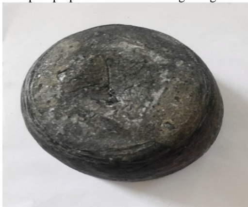
Fig. 2 MMC (AA6351+2.5% of Al 2 O 3 )

Now the mixed composite after cooling and solidification is cut into desired shapes for testing mechanical properties on the band saw machine. The machine is an electrically driven machine which is used to cut the hard composites. The MMC samples prepared are shown in figures given below.