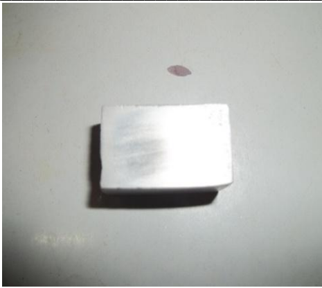
Fig. 5 MMC sample prepared for hardness test