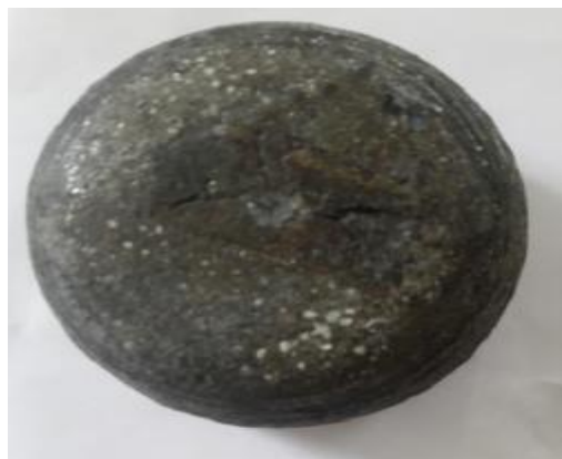
Fig. 4 MMC (AA6351+7.5% of Al 2 O 3 )