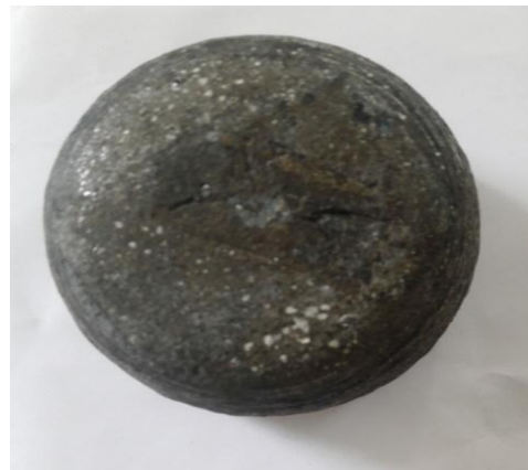
Fig. 3 MMC (AA6351+ 5% of Al 2 O 3 )