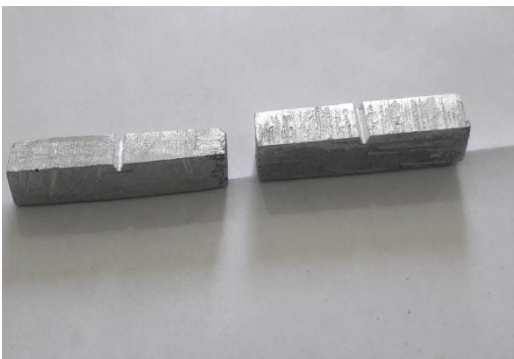
Fig. 7 MMC sample prepared for toughness test