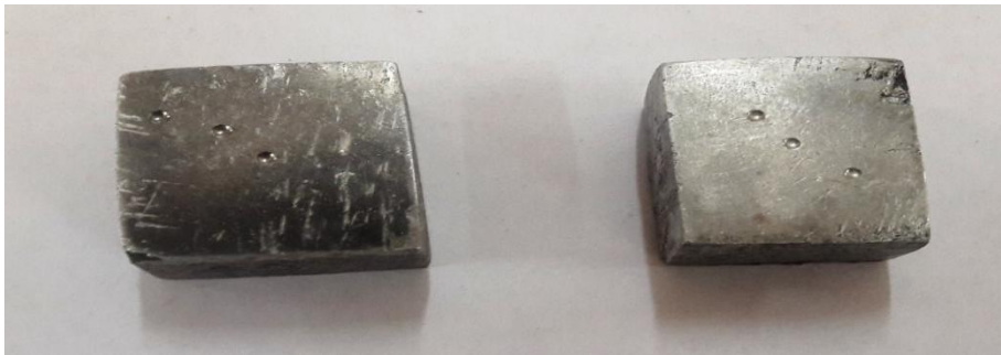
Fig. 10 MMC sample after indentation on hardness testing machine

The hardness test was carried on Rockwell Hardness testing method. For hardness testing, the samples of AA6351/2.5, 5, 7.5% wt. Al 2 O 3 composite were prepared as per dimension (10 mm x 10 mm x 25 mm) as ASTM E18-05, standard.