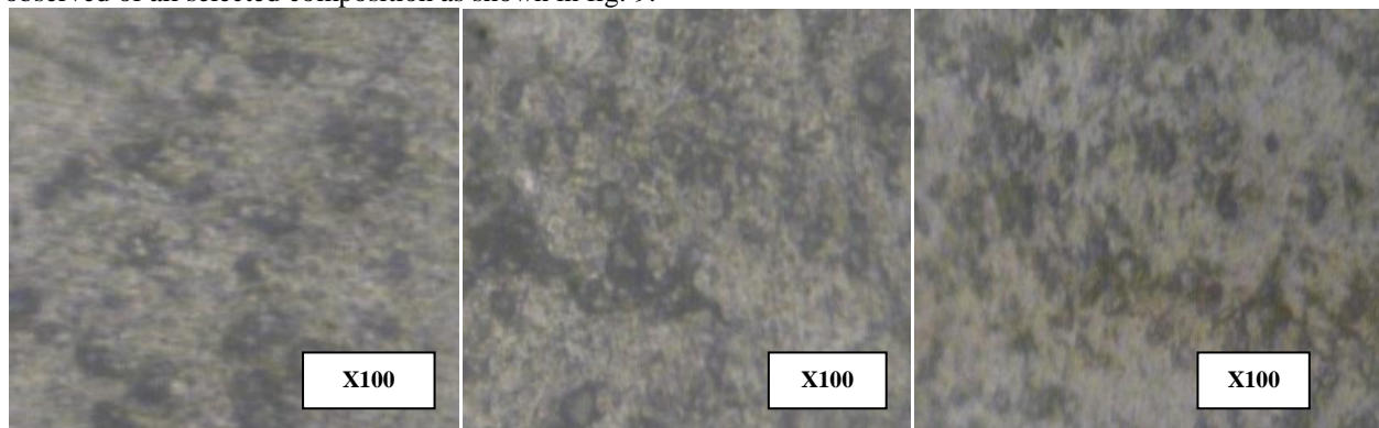
Fig. 9 (a) AA6351+2.5 % Al 2 O 3 reinforcement (b) AA6351+5 % Al 2 O 3 reinforcement (c) AA6351+7.5 % Al 2 O 3 reinforcement

The microstructures of the MMC samples are seen using metallurgical microscope. The term 'microstructure' in metal matrix composites is used to describe the appearance of the reinforcement material. A reasonable working definition of microstructure is the arrangement of phases and defects within a material. Samples of as cast MMCs for microstructural examination were prepared by grinding through different sizes of grit papers. Then the samples were etched with the etchant i.e., Keller's reagent (2.5mL nitric acid, 1.5mL HCl, 1.0mL HF, 95.0 ml water) [12]. The microstructure of etched samples was observed by using Metallurgical Microscope. Uniform distribution was observed of all selected composition as shown in fig. 9.