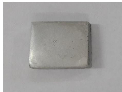
Fig. 8 MMC sample prepared for microstructure